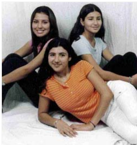
The Three Aleman Girls